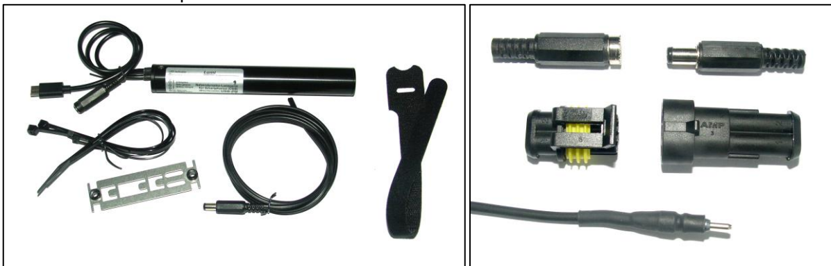
Mounting Set Removable (with Harvester USB-PM), variable connectors

1) Only cable with connector supplied as normally it connects to available SON coax junction, variable length on request up to 130cm